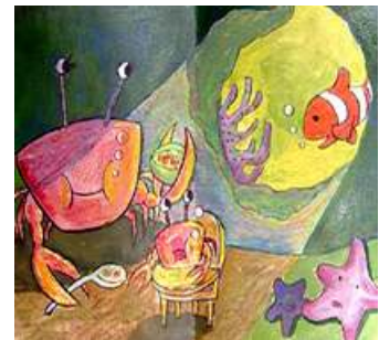
One fish: Would you please give me a spoon ?