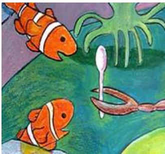
Two fish: May I have a spoon , please?"