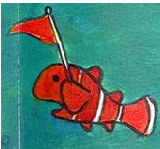
Red Fish: Watch out! Here he comes! Let's get in!