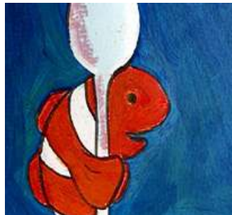
Red Fish: Let's make a spoon house!"