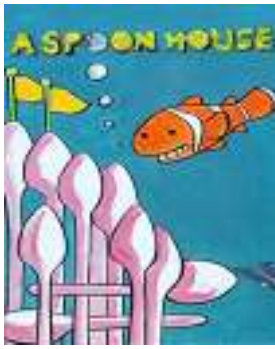
A Spoon House