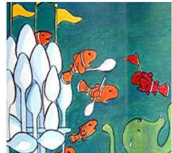
A school of fish: Look, it's our spoon house!