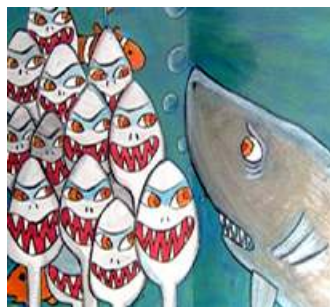
Shark: Ah...! Who is it?!