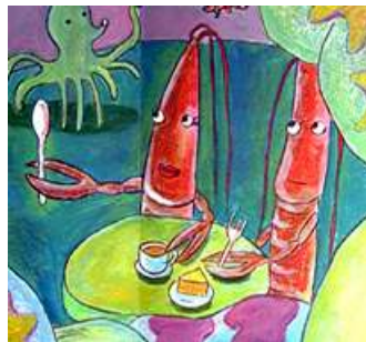
Shrimp: Sure. Here you are!