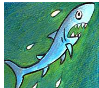
Shark: Help! Help!