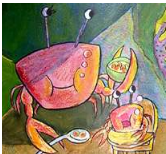
Crab: Yes, here you are.