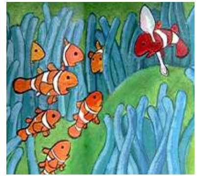
Red fish: I have an idea! Let's go get some spoons